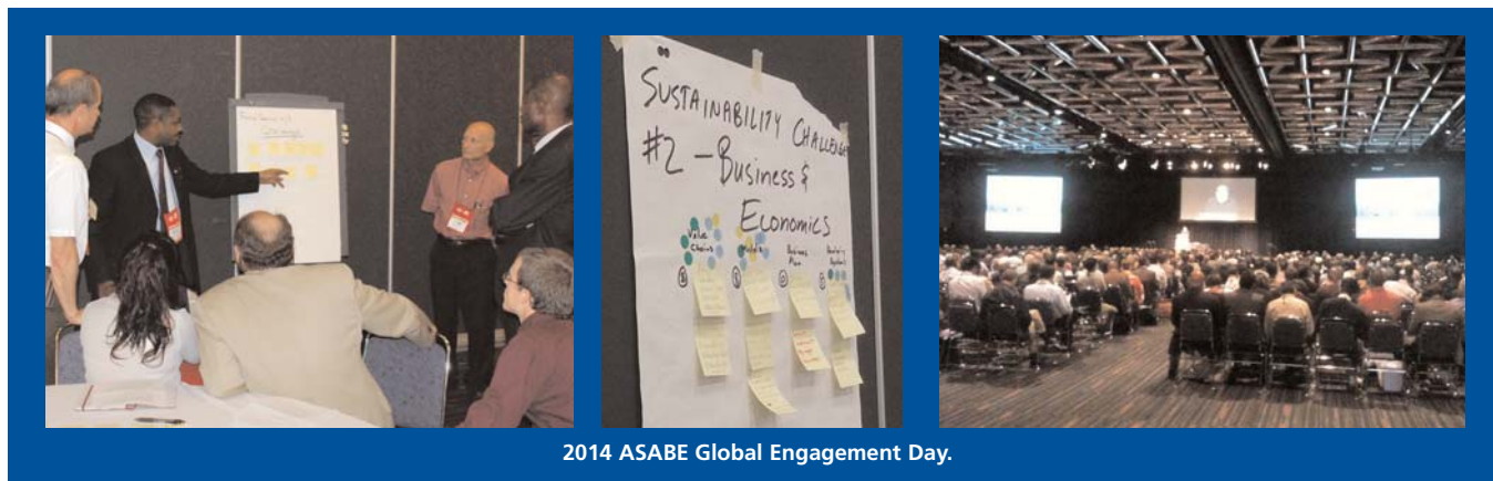
2014 ASABE Global Engagement Day.