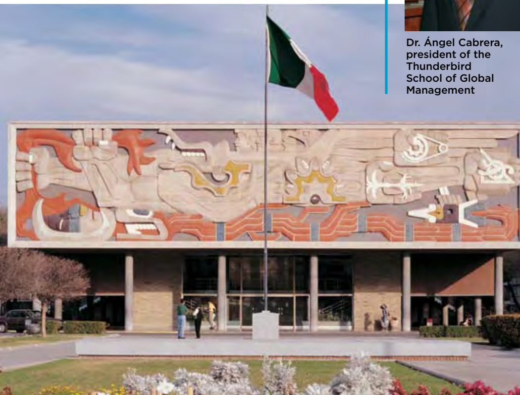
The Instituto Tecnológico y de Estudios Superiores de Monterrey in Mexico and Arizona’s Thunderbird School of Global Management offer a joint Global M.B.A. degree.