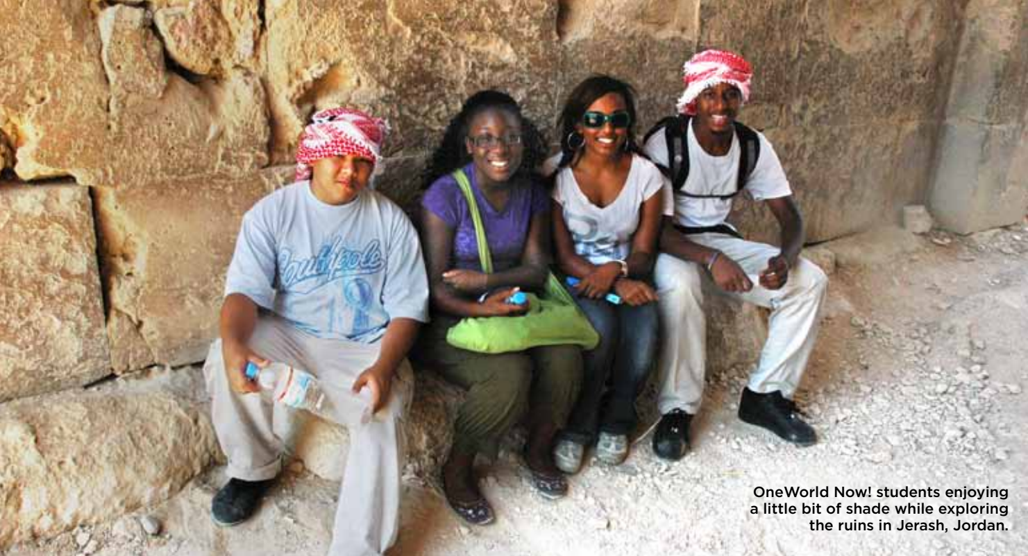
OneWorld Now! students enjoying a little bit of shade while exploring the ruins in Jerash, Jordan.