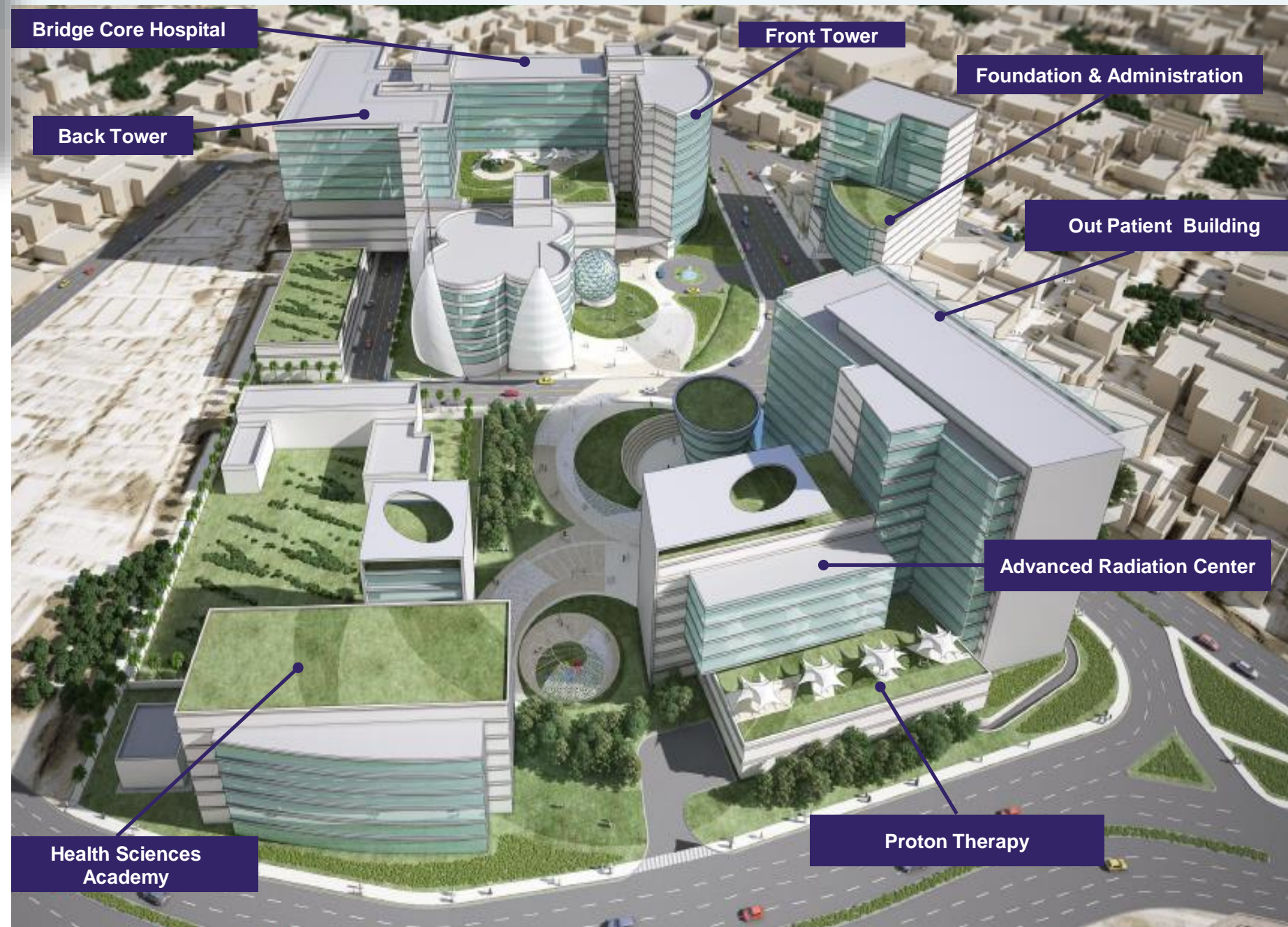
th Birdseye View