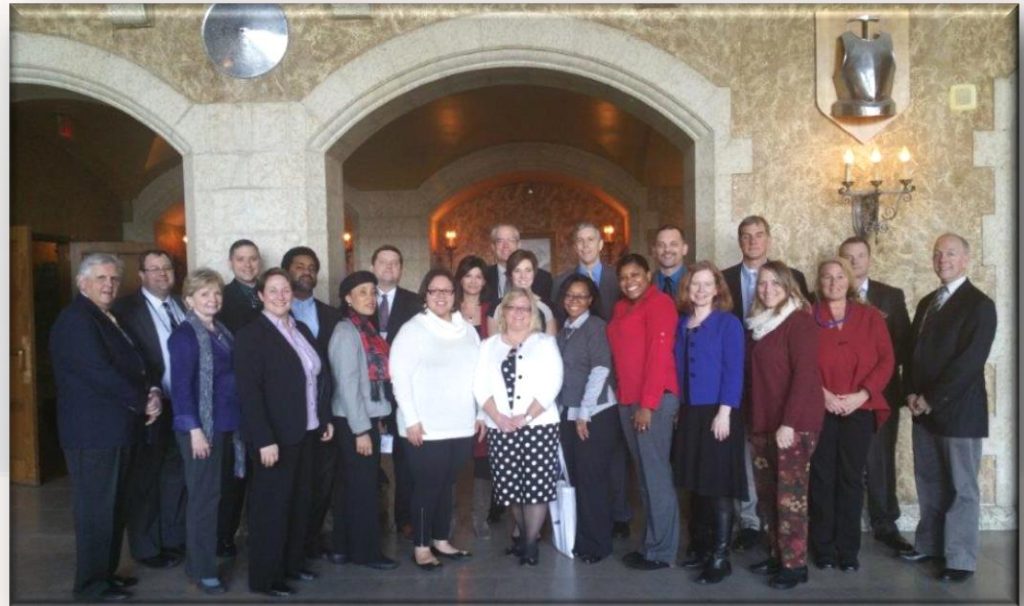
International Summit on the Teaching Profession 2015