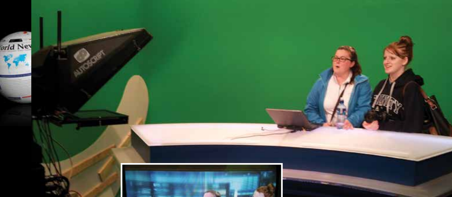
Students from Virginia Commonwealth University participated in a "Media in Ireland" summer course and visited the Gaelic-only TV station TG4.