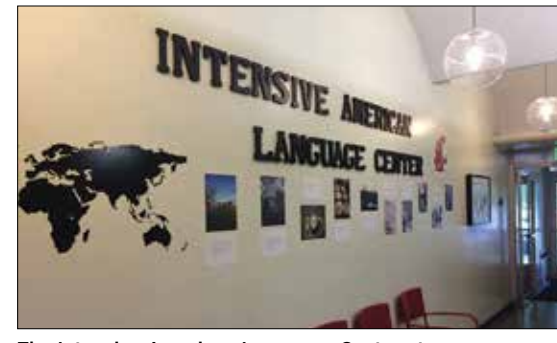
The Intensive American Language Center at Washington State University

At Drexel, recruiting graduates, faculty, staff, and neighbors to the global learning