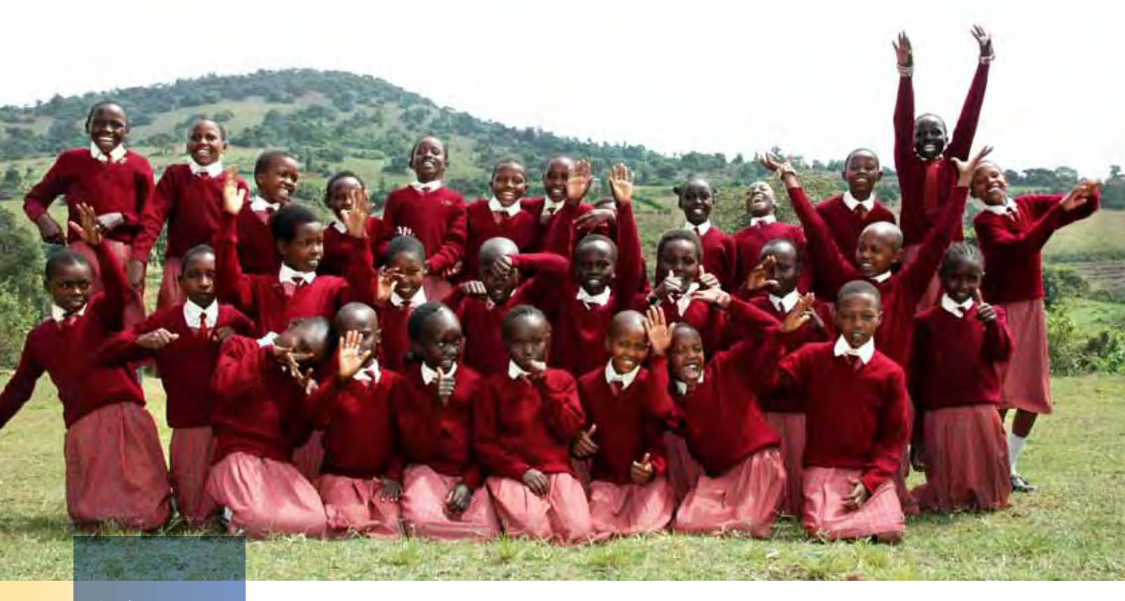
Students are exuberant after receiving their uniforms at the Kakeyna Center for Excellence.

to school. "We want to touch families from different parts of the village, and also touch lives of those girls who never would have a chance to be in this position," she says.