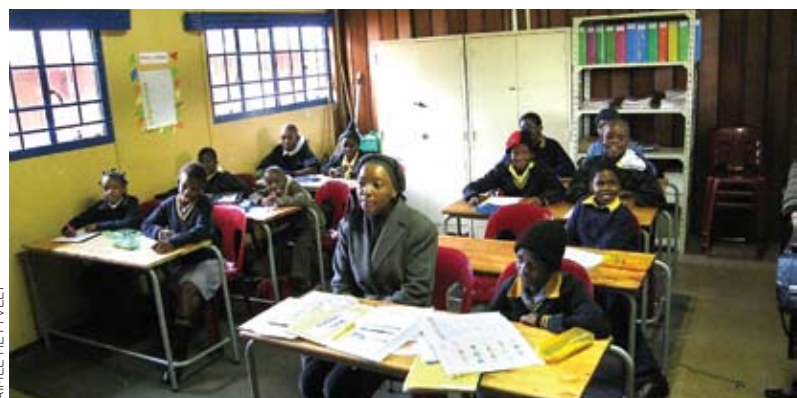
Students at the Zodwa Special School for Children in the Gauteng Province, Tshwane South District, of South Africa participate in a numeracy lesson. Students and faculty from USD's School of Leadership and Education Sciences visited this school for learners with special educational needs in June of 2008.