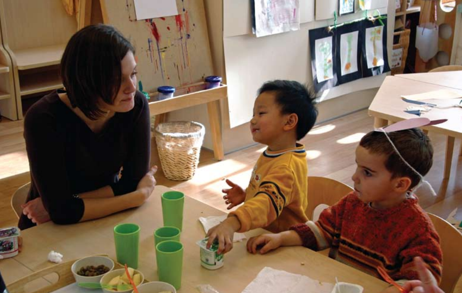
MSU students experience diverse field placements such as this bilingual Chinese-English Immersion school in Lansing, Michigan.