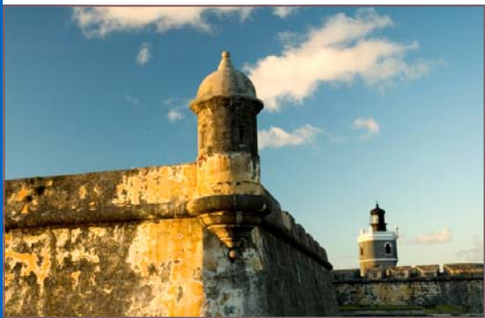
Lighthouse in El Morro—Old San Juan