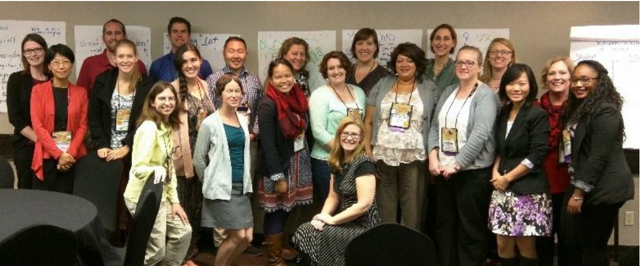
F-1 Advising Intermediate Pre-Conference Workshop attendees.