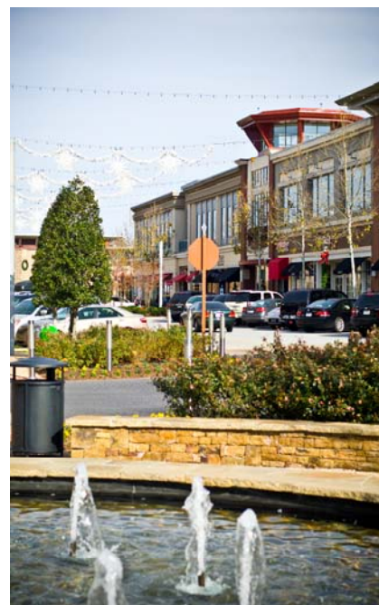
Pinnacle Hills Mall— Rogers, AR

New Short Links to Education Abroad Tools: