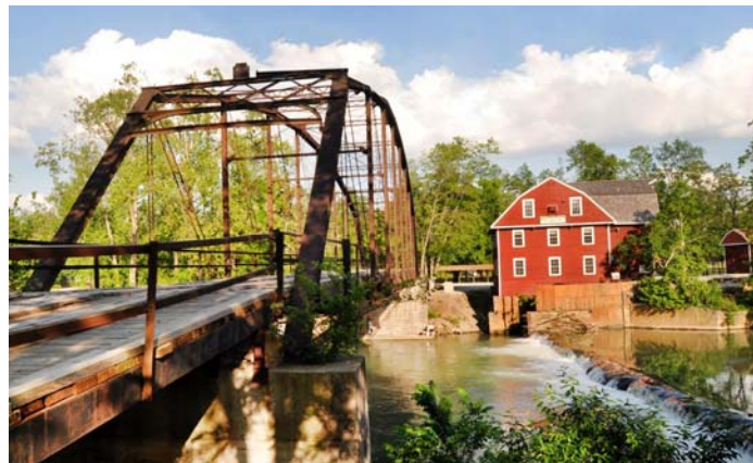
War Eagle Mill Bridge— Arkansas

Region III is one of NAFSA's 11 geographic regions. Each region is governed by an elected chair and a team of representatives from the various NAFSA professional sections and educator groups. Region III is comprised of Arkansas, Louisiana, Oklahoma and Texas. Within Region III there are over 900 institutions that are approved by the Student Exchange Visitor Program (SEVP) to accept international students and scholars. The largest number of institutions is in Texas with 592 institutions, then Oklahoma with 120, Louisiana with 103 and Arkansas with 90. Our membership is very active on the local, regional and national level. Many Region III members hold or have held leadership positions at the national level. Region III is also very strong in issues relating to advocacy to advance international education. We are proud to say that all four states have passed resolutions in their Congress and/or Senate in support of advancing international education.