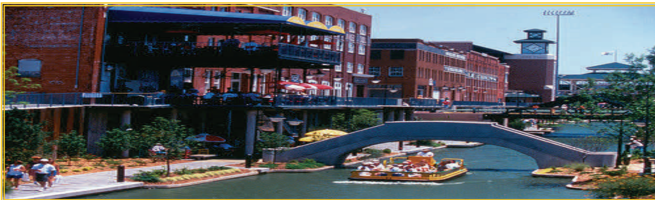
Oklahoma City Bricktown Canal