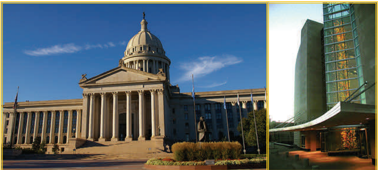
Outside of the Oklahoma Capital building & Oklahoma City Museum of Art

(Some text from Oklahoma City Convention and Visitors Bureau)