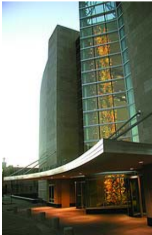
Oklahoma City Museum of Art