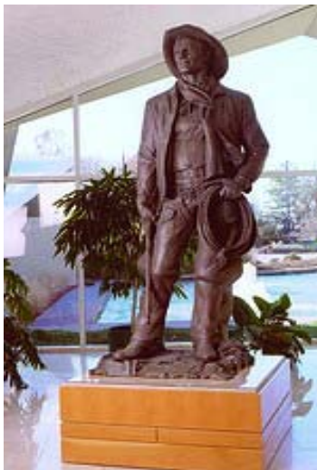
National Cowboy & Western Heritage Museum in Oklahoma City (photos page 6&7)