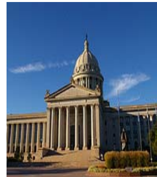
Outside of Oklahoma Capitol Building

A new Part 6 of Form I-129 now requires compliance with deemed export control regulations. NAFSA sessions in Van-