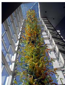
Chihuly Tower at Oklahoma City Museum of Art Lower/right: Oklahoma City Myriad Gardens

Photos throughout the newsletter are from The Greater Oklahoma City Chamber of Commerce Photo Gallery. Enjoy OKC views!