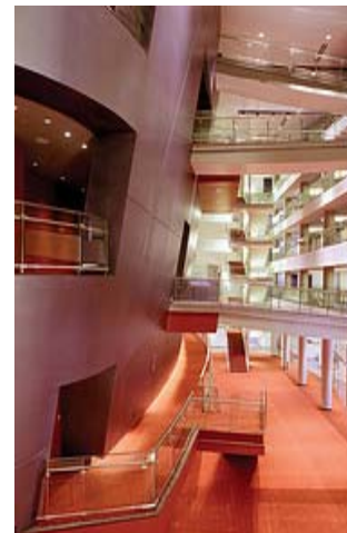
Civic Center Music Hall in Oklahoma City

Now, to the fall conference- please consider presenting on a topic that is related to ESL teaching or administration, or for a broad audience. The region team is continually looking for ways to make sure that each hour's sessions provide something relevant for everyone attending, but all our presenters are volunteers, so we can only schedule what people have volunteered to present. Presentation proposals (this is only a brief description and title of what you want to present- you don't have to actually work up the presentation until the fall-yay!) are due soon (July 5th!) - please see the region website for details and suggested topics to present on.