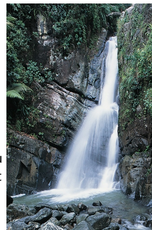
El Yunque Rainforest, Puerto Rico