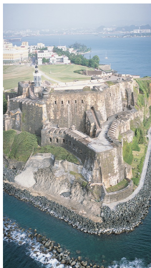
Fort El Morro, Puerto Rico

Do you have an open position in your office? Submit your job postings for our weekly e-mailing to laura- semenow@utulsa .edu